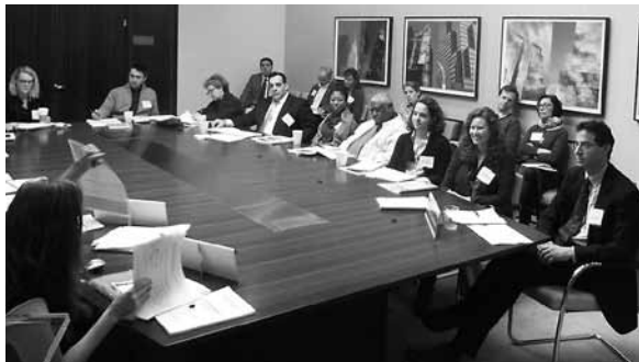
Time Warner, HBO, and DC Comics hosted a clinic on contracts and intellectual property for community arts and other nonprofit organizations.

Lawyers Alliance welcomes the opportunity to team up with dynamic businesses committed to corporate responsibility to ensure that nonprofits receive appropriate legal information to operate strong programs. The clinic model can be an effective way for nonprofit managers and pro bono attorneys to focus on a particular topic and identify further legal needs.