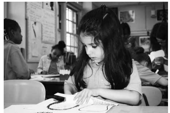
SCO Family of Services (SCO) each year helps 60,000 vulnerable children, teens, adults, and families