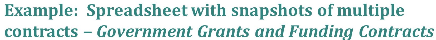
Grants and Funding Contracts